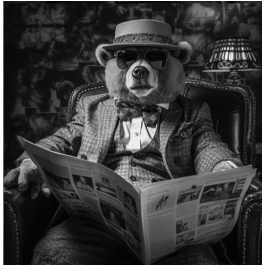
Figure 3: Opulent Bear (Midjourney)

No doubt, the picture is influenced by thousands of images paired with each keyword. All of the images of teddy bears in the training data inform a latent construct of a teddy bear nested within the model; likewise, all of the images of someone staring hypnotically inform a latent construct of a hypnotic stare. 160 But the product of this particular prompt is something entirely new. 161 A text-to-image model like Midjourney does not merely combine and unpack learned latent features; it generates a novel instance derived from the latent space that may share characteristics with the input prompt. 162 The picture is not just new; it is surprising! One of the fun things about this particular image is that although the bear's demeanor is consistent with him staring hypnotically, the bear is actually wearing sunglasses that leave the details of his gaze to our imagination.