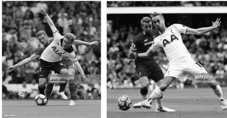
Figure 4: Images from the Getty Images Complaint Comparing Training Data to Stability AI Model Output 166

In addition, there is the Snoopy problem: “[T]he more abstractly a copyrighted work is protected, the more likely it is that a Generative AI model will ‘copy’ it.” 167 Text-to-image models are prone to produce potentially infringing works when the same text descriptions are paired with relatively simple images that vary only slightly. 168 This makes a text-to-image model like Stable Diffusion especially likely to generate images that would infringe on copyrightable characters; characters like