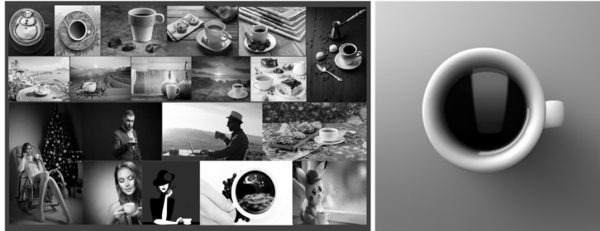
Figure 2: Coffee Cups in the Training Data Compared to Model Output 156

The various coffee cup images on the left side have something in common with the one on the right—the coffee cup produced by Stable Diffusions is white ceramic and is round, it has a single handle, and it is filled with black liquid. 157 But notice that the newly rendered image of a coffee cup is not substantially similar to any other images in the training data that I was able to locate. 158 Stable Diffusion is not an archive of images of coffee cups; the model has learned something about the coffee cup distinct from cakes, sunsets, sunrises, newspapers, and men with facial hair—all of which can be seen in the training data examples on the left. The evidence that we can see with our own eyes shows that the process of training the Stable Diffusion model in the above example was not merely a form of compression; it is a form of abstraction.