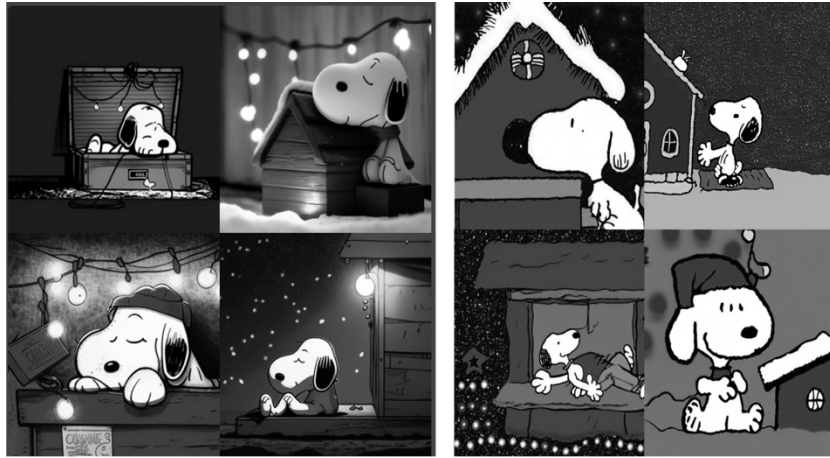
Figure 5: Snoopy as Learned by Midjourney and Stable Diffusion 170

Fifth, Generative AI can become a tool of infringement in the hands of a determined user. 171 Although it is very difficult to control the output of an LLM or a text-to-image model by simple prompting, a user with detailed knowledge of a copyrighted work might be able to remake it, at least at a vague level of similarity. 172 Of course, this is easier for works protected at a more abstract level, such as copyrightable characters, or which customarily entail very broad derivative rights, such as a novel. 173 For example, when I asked ChatGPT to “Summarize ‘Saturday’ by Ian McEwan” and then to “imagine and outline a sequel to this book, called ‘Sunday,’ where the Perowne and Baxter meet again,” it outlined a simple plot continuing the story that could easily be fleshed out into “a meditative exploration of the aftermath of trauma, the possibilities of redemption, and the enduring nature of human connection” in the contemplative style of Ian McEwan. 174 If I used ChatGPT to expand on each of the chapter descriptions, I could generate my own McEwan novel. So, in the right hands, a Generative AI model can be used as a tool of copyright infringement, but the same is also true of a typewriter. 175