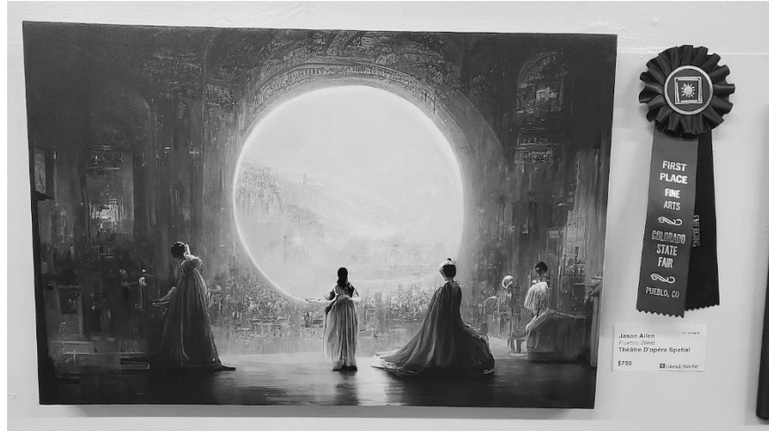
Figure 1: Jason Allen’s AI-Generated Art with First Place Ribbon as Pictured in the Washington Post 6

“Generative AI” systems, such as the Generative Pretrained Transformer (GPT) and Large Language Model Meta AI (LLaMA) language models and the Stable Diffusion and Midjourney text-to-image models, were built by ingesting massive quantities of text and images from the internet. 7 This was