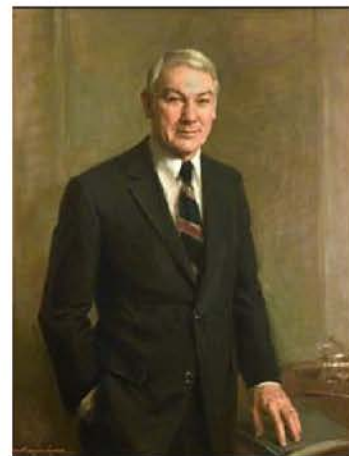
THE HONORABLE G. WILLIAM MILLER (1925-2006)