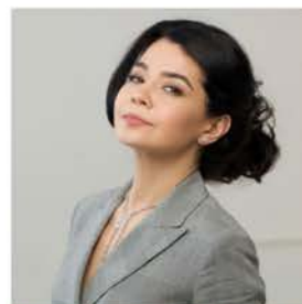
Editor-in-Chief of Ukrainska Pravda.