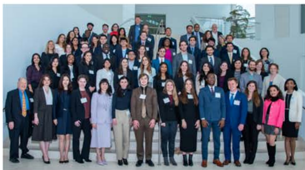
2023 Salzburg Cutler Fellows Program Participants