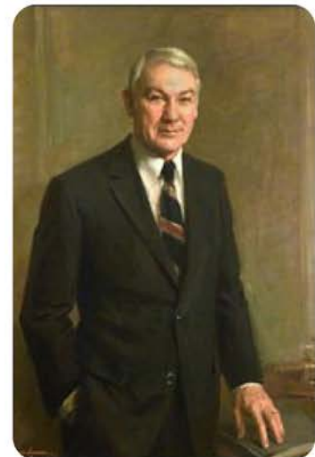
THE HONORABLE G. WILLIAM MILLER (1925-2006)