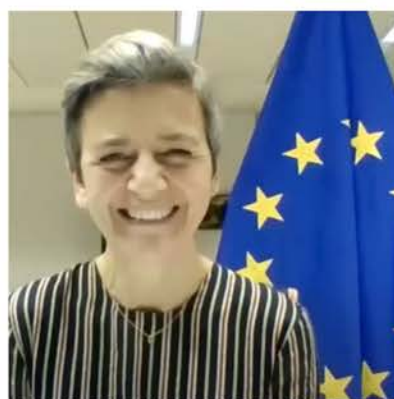
European Commissioner for Competition and Executive Vice President, European Commission for a Europe Fit for the Digital Age