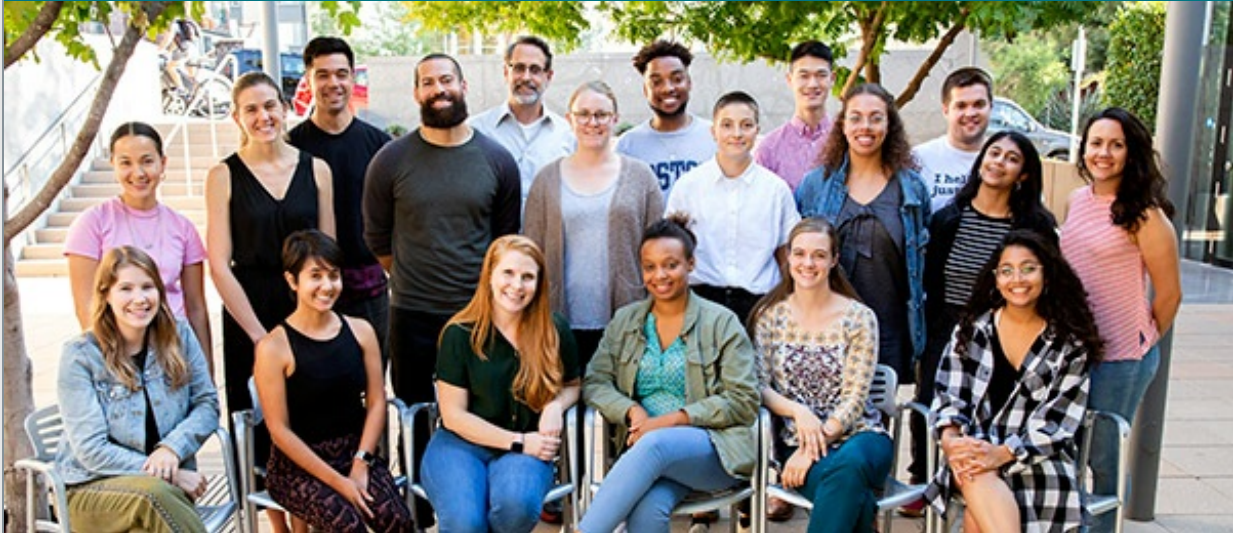
Our fall 2019 clinic team