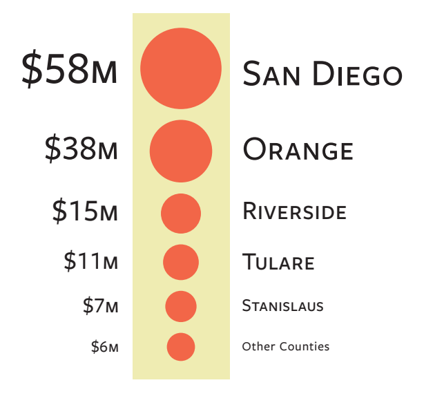
CHART 3: POST-SB 190 COUNTIES COLLECTING JUVENILE FEES BY DOLLAR AMOUNT, 2018

We found that some counties have not notified young people and families of SB 190 fee relief, and some counties have not updated internal- and external-facing fee materials.