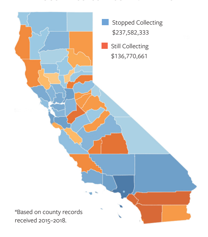
CHART 2: COUNTIES STILL COLLECTING PREVIOUSLY ASSESSED JUVENILE FEES

Counties have taken a variety of steps to discharge previously assessed fees depending on how the outstanding balances were recorded, for example, as accounts receivable, civil judgments, liens, and other enforceable obligations. 45 Counties have discharged and written-off accounts receivable via board resolution,46 vacated and declared civil judgments as satisfied via court order,47 released liens and record-