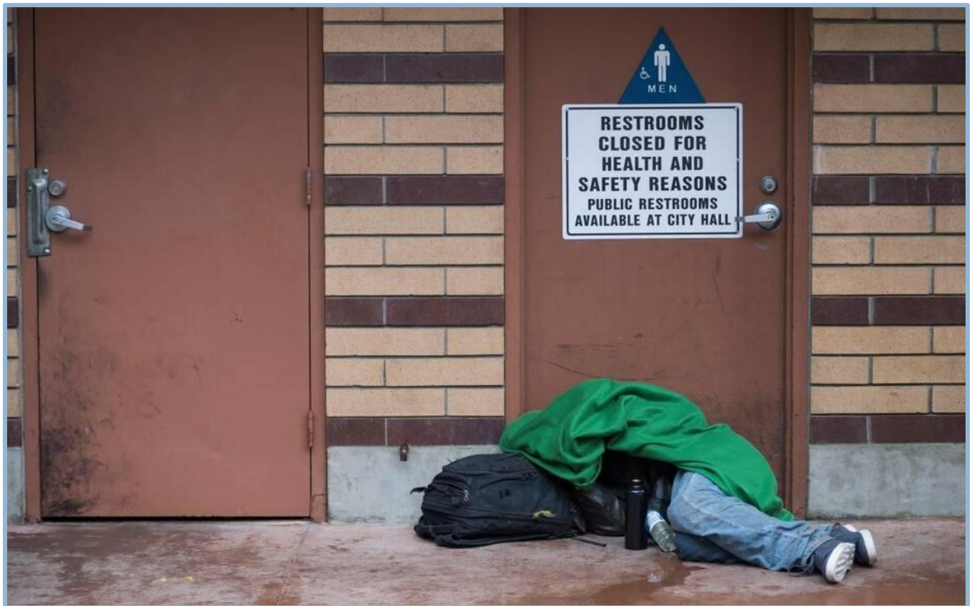
A person sleeps outside a closed public restroom in Sacramento. October 9, 2017

Provide ongoing basic services (potable water, toilets, hand washing stations, showers) at all established encampments.