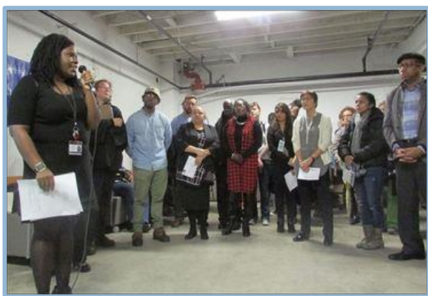
Members of Alameda County Health Care for the Homeless holding a listening session attended by nearly 50 homeless residents in December 2016.

Related—and fundamental—decisionmakers and service providers must become deeply inspired to solve water-access problems, which, particularly in the case of drinking water, can be largely invisible: although service providers and policy experts interviewed for this report were generally very aware that lack of