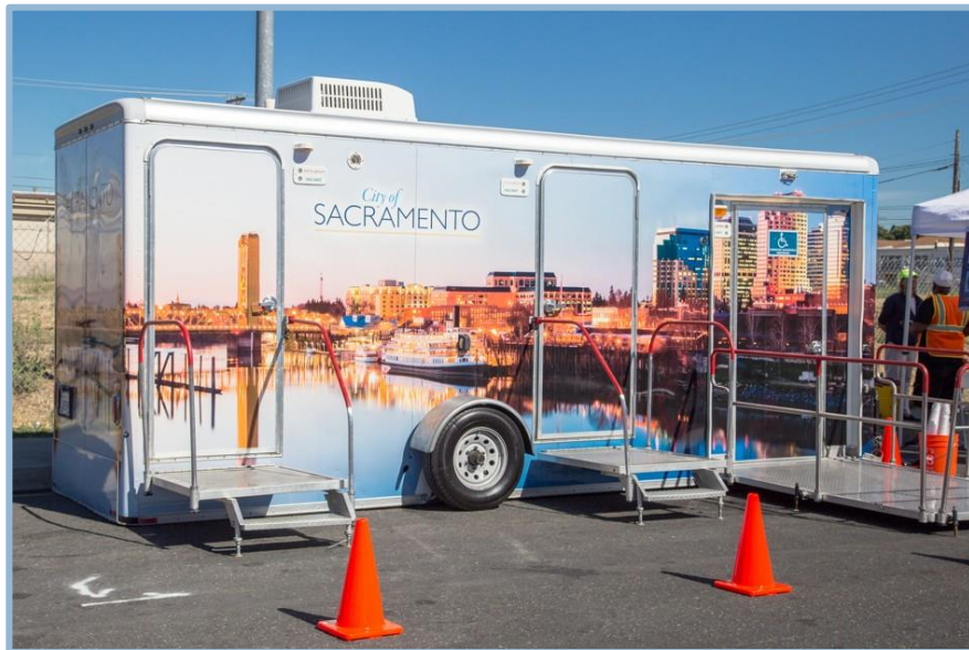
Sacramento's Pit Stop portable toilet project. Published on CityLab December 2, 2016.