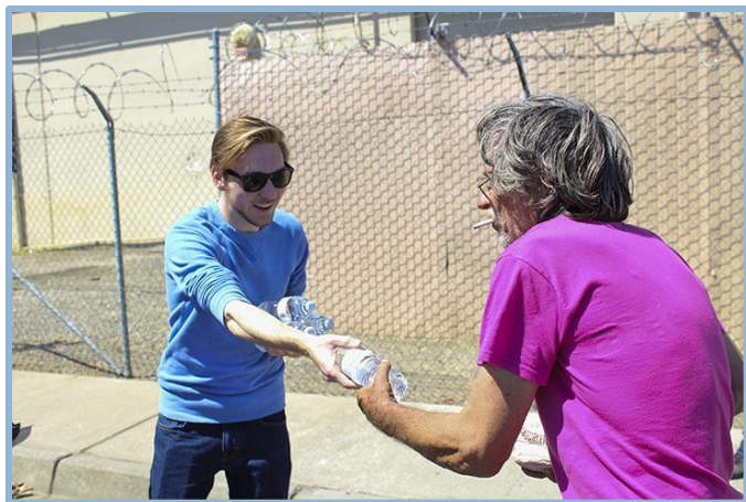
A Sacramento man hands a bottle of water to a homeless Sacramento resident. April 20, 2016.