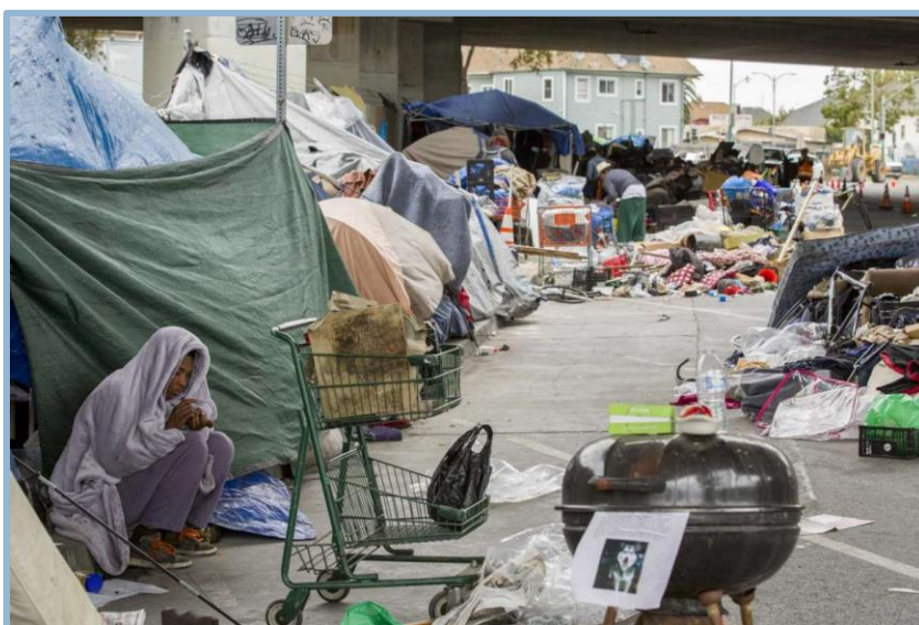
Residents in an Oakland encampment. Photo Credit: Santiago Mejia, The San Francisco Chronicle . October 9, 2017.

Unsheltered residents in California have less access to potable water, showers, and toilets than is required by minimum standards for refugee camps under international law. Efforts to improve access are hampered by a perception that providing for the basic needs of unsheltered people undermines efforts to move these residents into permanent housing, by sapping financial and human resources allocated for low-income housing, and eroding public support for housing by normalizing homelessness.