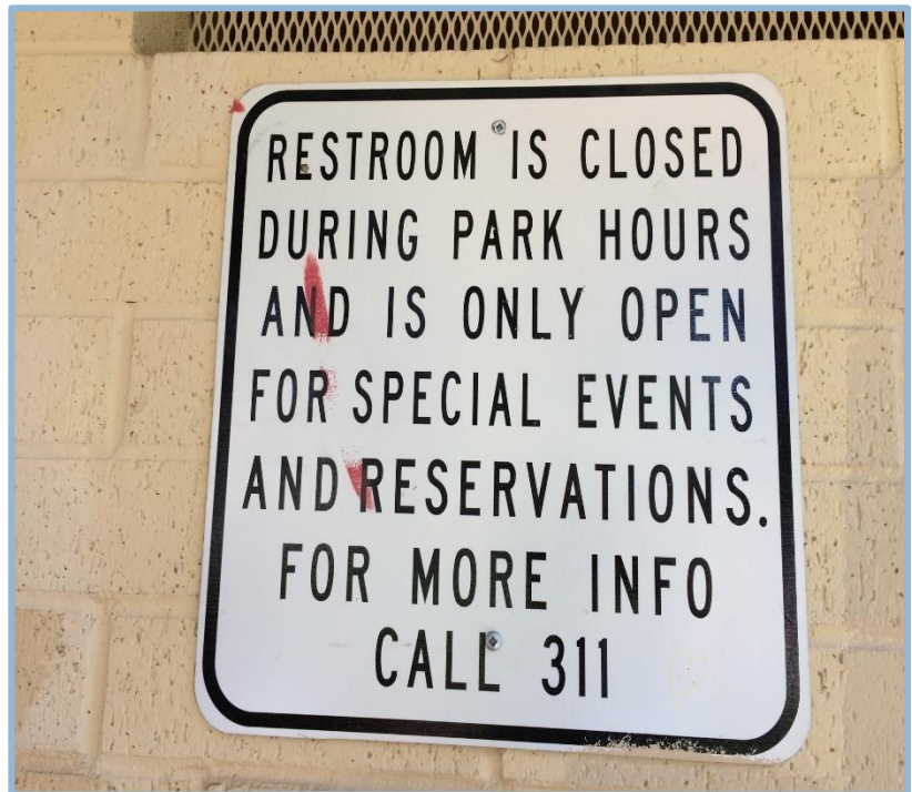
Sign posted on a “public” restroom in a Sacramento City Park. February 2017.

According to the Sacramento Bee, the City’s Central Library has become “the most reliably available public facilit[y] for homeless people in downtown Sacramento.” 99 The library is, of course,