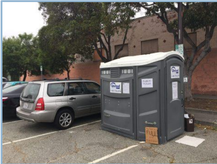
The original portable toilet installed near the Here/There encampment in Berkeley in July 2017.

would allow residents to obtain a permit for a neighborhood public toilet using an official petition. At the same meeting, in response to the aforementioned advocacy, the Council approved the placement of a port-a-potty on a city lot near the Here/There Encampment in South Berkeley. 126 This toilet, paid for and maintained by Friends of Adeline and installed by the City, was about a block away from Here/There at the corner of Martin Luther King, Jr. Way and Alcatraz. The intent was to provide to the long-established encampment a portable toilet that would also be accessible to passersby and nearby farmer's market customers. 127