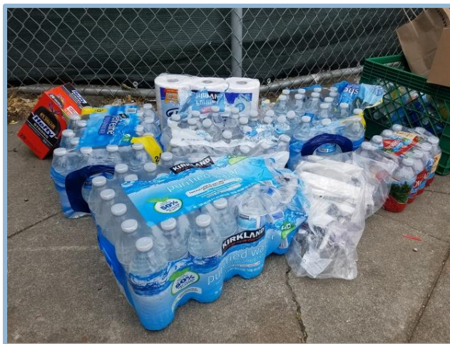
Cases of bottled water donated during an eviction of an Oakland encampment. May 28, 2018.