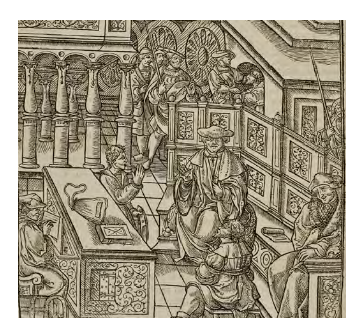
Above: Woodcut of a court scene from Praxis criminis persequendi, Jean Milles de Souvigny, 1541.

The following sections explore the historical roots of these differences.