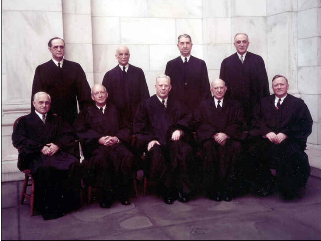
WARREN COURT, 1955