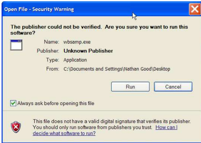
Figure 2 Microsoft Windows XP SP2 Warning

notification includes a link to the publisher information as well as links to privacy policy information. The purpose of this notice condition is to test if a commonplace heightened-notice practice, active by default, will affect installation behavior.