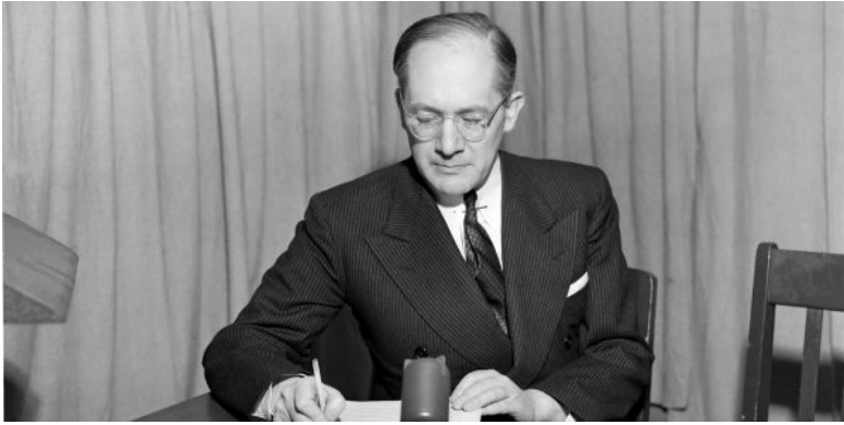
Raphael Lemkin (1900–1959)