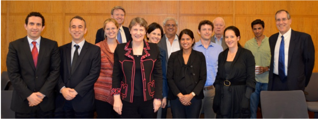
Helen Clark, UN Development Programme (center), with Berkeley Law and UC Berkeley faculty, Berkeley Law, November 7, 2012