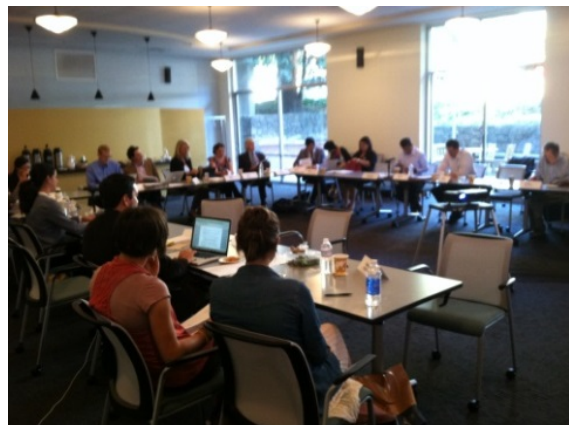
Northern California Intl Law Scholars Meeting, Berkeley Law, September 7, 2012