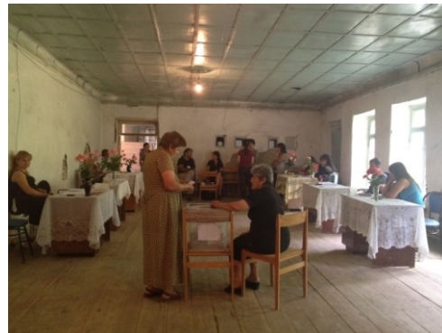
Voting in Nagorno-Karabakh, a republic in the Southern Caucasus