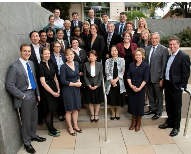
Participants in the Four Societies Conference on “Disasters and International Law,” Berkeley Law, September 28-29, 2012