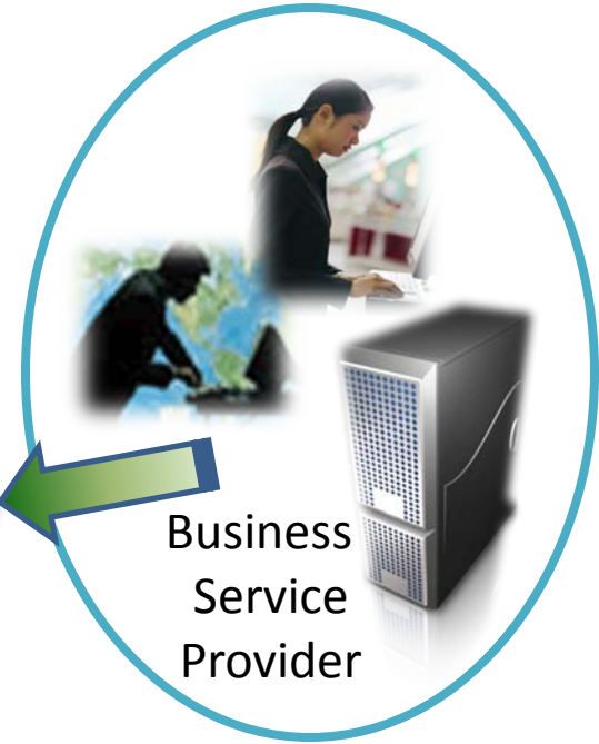
Business Service Provider